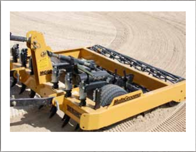
FRONTIER ARENA RAKE