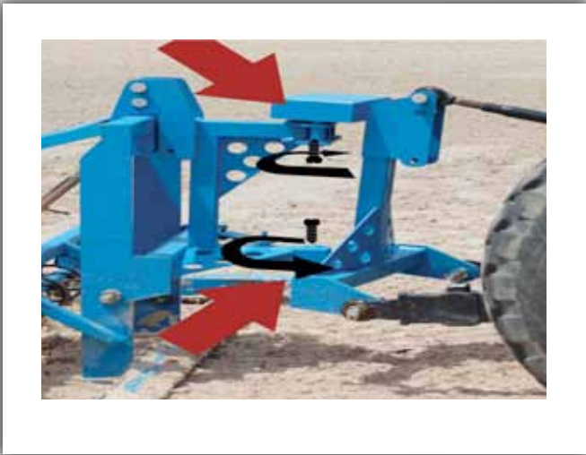
ESI SOIL MASTER